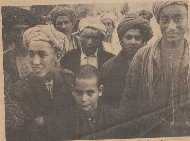
Typical faces of Afghanistan's multi-racial society.